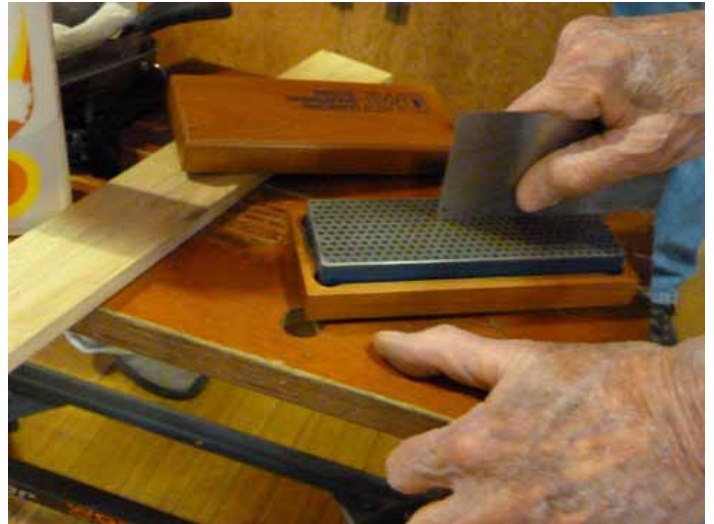
Chuck Walker sharpens a card scraper on a diamond hone

Scrapers deliver a smooth surface as long as they are properly sharpened. The key is to roll a consistent burr on the edge. Chuck showed the process for preparing a card scraper by first flattening the edge on a diamond hone. Using water as a lubricant, the broad surface of the card is rubbed along the hone in order to eliminate the existing burr. Once each side has been flattened, the edge is now addressed. Held 90 degrees to the hone, the metal is worked alternately outward to both boundaries of the cutting edge. The result of this motion is to roll a double edged burr. The burr is further refined by running the edge perpendicular to the hone.