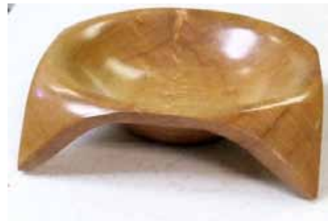
The finished square bowl