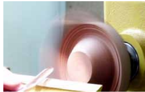
The bottom is turned, shaping the wings and bottom of the bowl