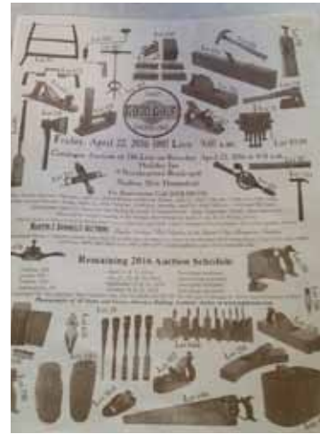
Tool auction flyer