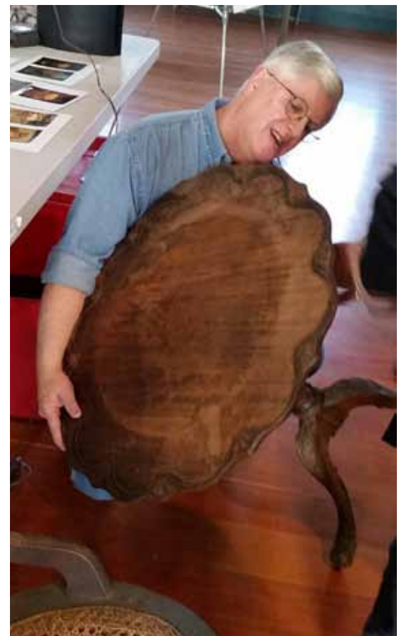
Can this table be saved?