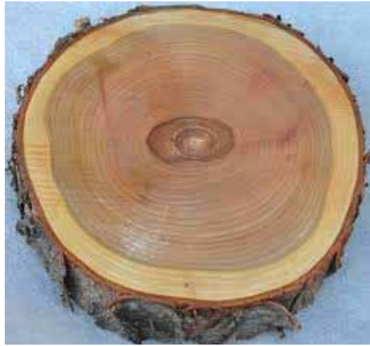
Black Cherry Growth Rings

1. According to the National Register of Big Trees (2012), the largest Black Cherry recorded in 2008 had a height of 95 feet found in Tazewell, VA.