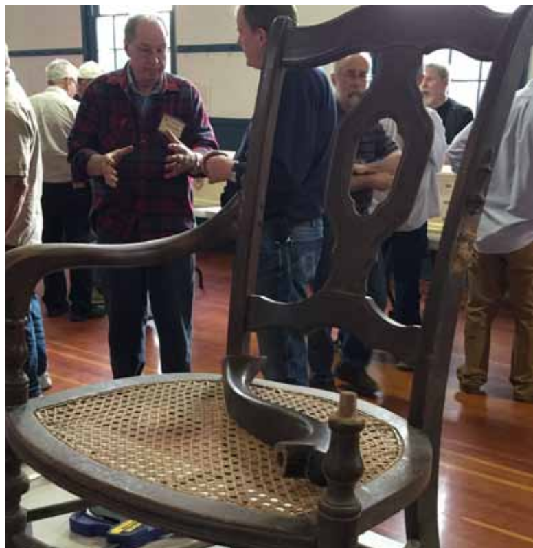
Broken chair arm