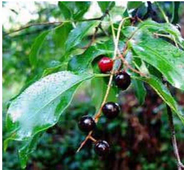
Black Cherry Fruit with Leaves

Black Cherry is a diffuse-porous wood, but it should be noted that the first row of earlywood pores is somewhat larger and generally in a continuous row. The pores are small and must be viewed with a lens. They run through the growth ring singularly and in